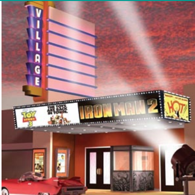
The renovated Village Theater is projected to reopen in March 2011.

doors in 1947 and closed in 2000. In 2008, the CDA entered into a Participation Agreement with Five Star Theatres, Inc., for a $2,675,000 grant for improvements to the Village Theater in exchange for the operator's commitment to showing first-run movies at the theater until 2026. The renovation is expected to take six months, with a projected opening in March of next year.