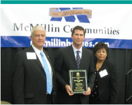
The Regional Leadership Award, sponsored by Union Bank, was given to Plaza Bonita Westfield Shopping Center.