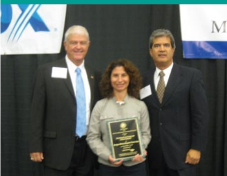
Sponsored by Bank of America, the Outstanding Corporate Citizen Award was presented to Scripps Mercy Hospital Chula Vista.