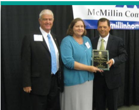
The Corky McMillin Best of South County Award was awarded to the Chula Vista Nature Center.