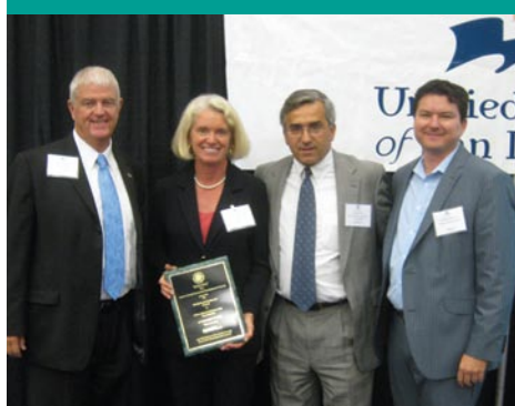
Sponsored by Parsons Brinckerhoff, the Bi-National award was given to International Community Foundation. (More photos on Page 5.)

a leader in establishing benchmarks and that has made a significant impact in the South County. Plaza Bonita Westfield